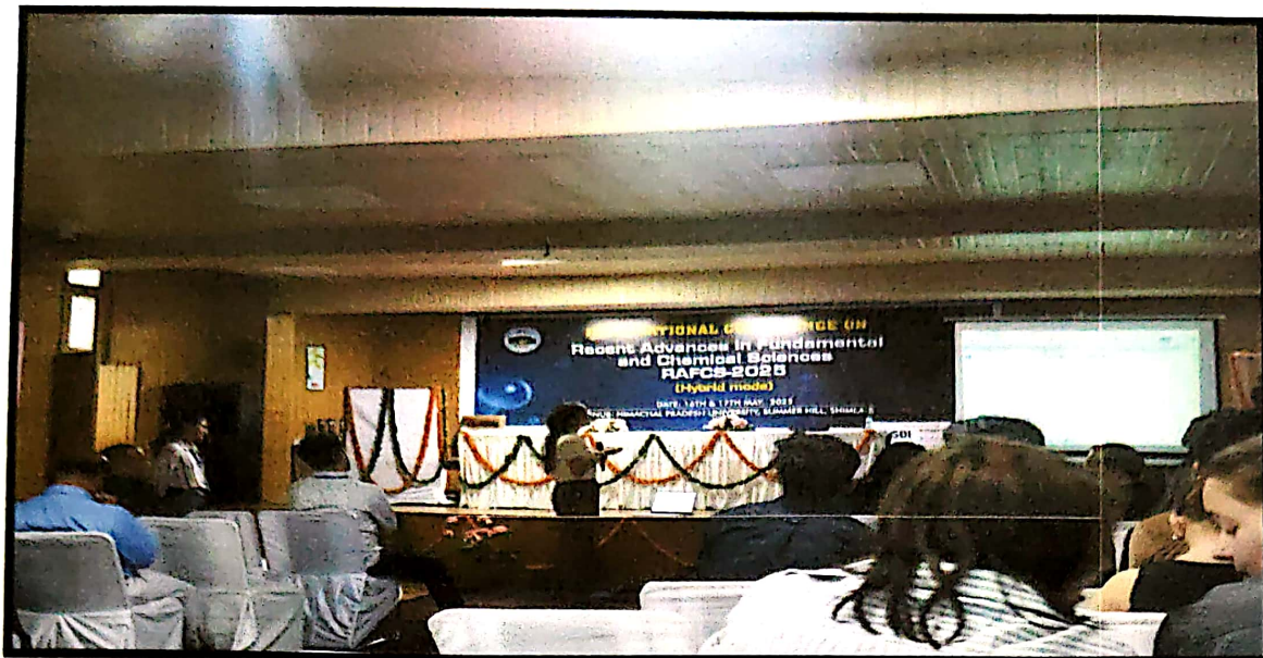
HOD DEPTT. OF PHYSICS